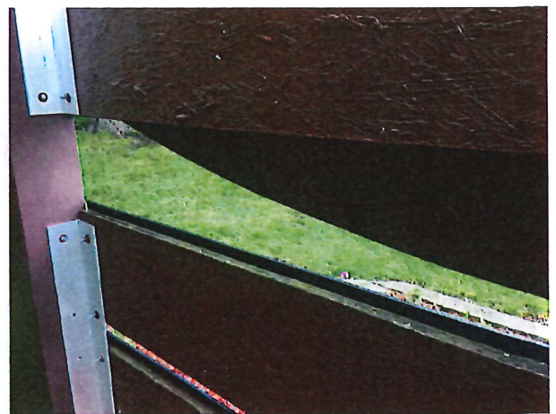
Back side of signs 3/4" particle board structure with aluminum L bracket Face of sign mounted to particle board